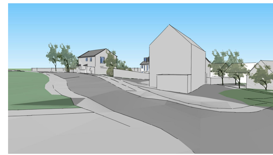
Street West View.