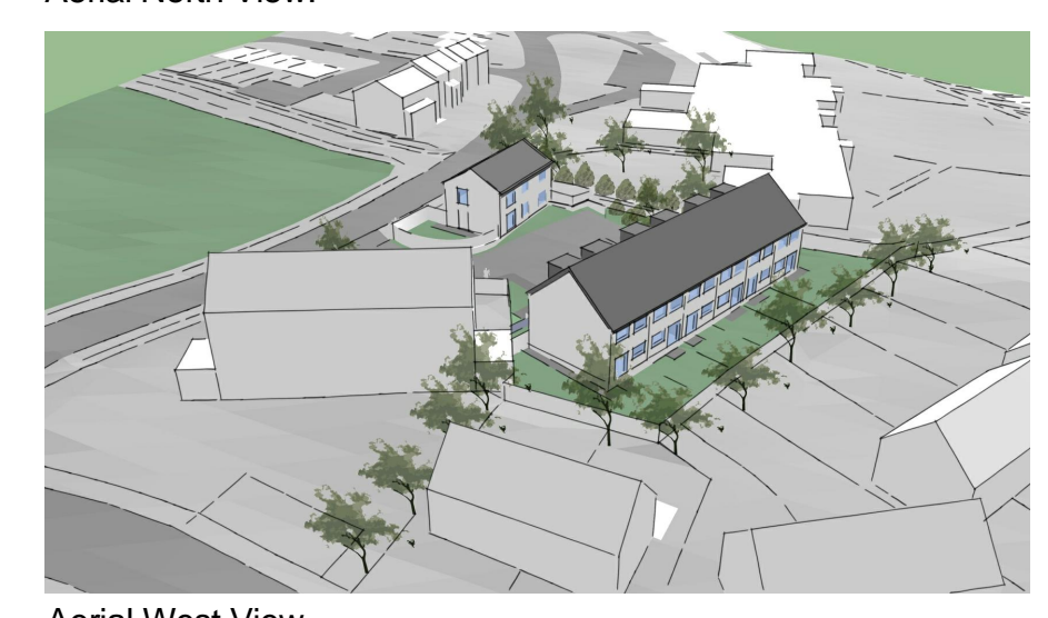
Aerial West View.