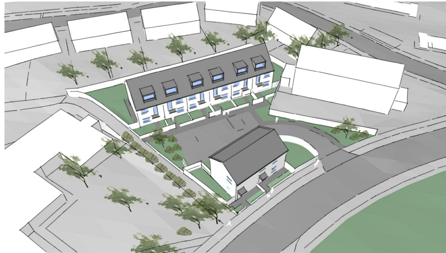
Aerial North View.