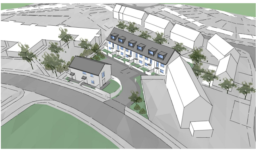
Aerial North View.