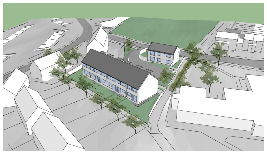
Ariel South View.