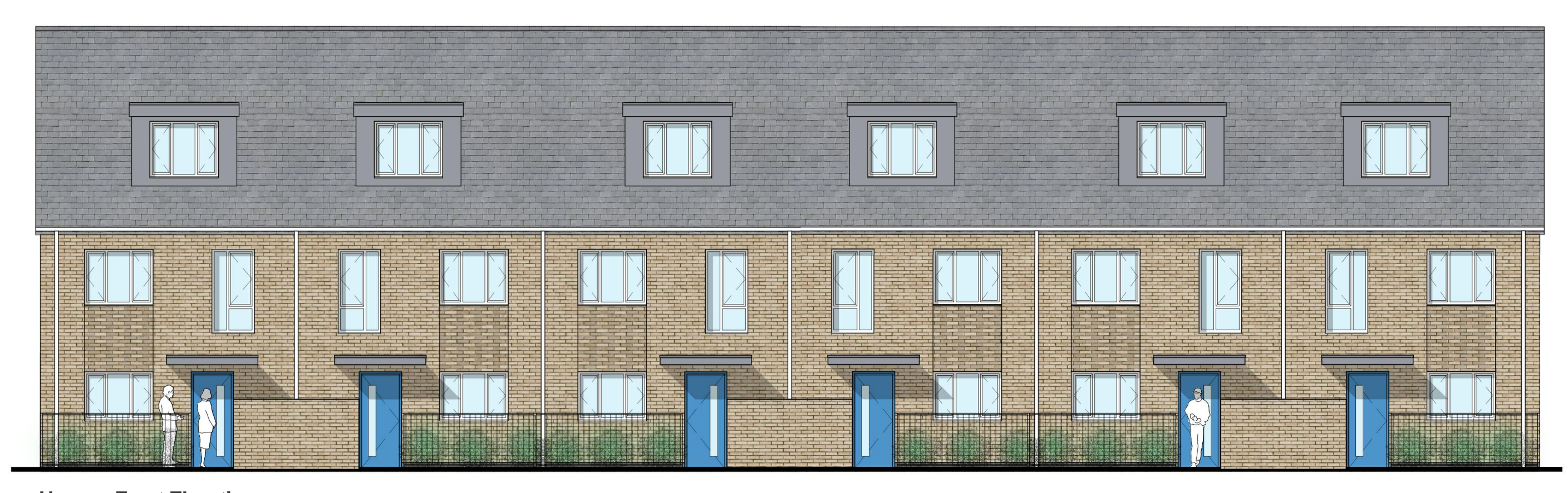
Houses Front Elevation